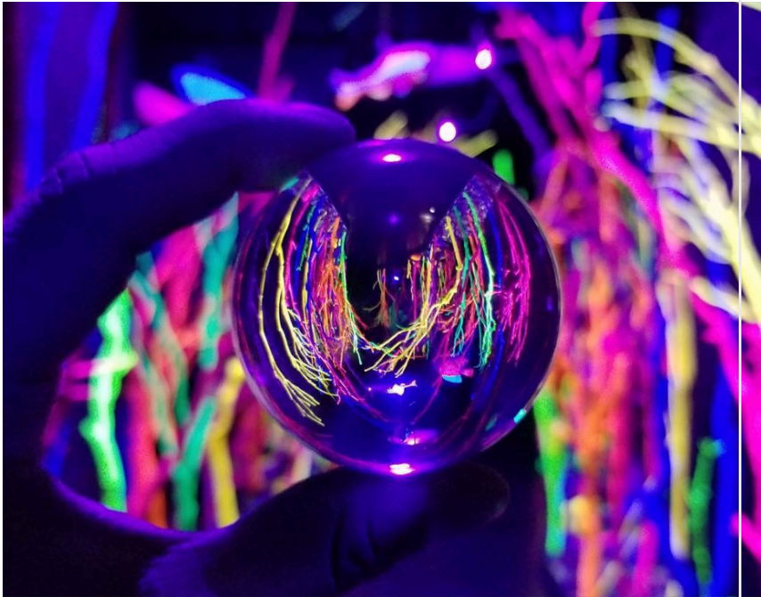
Meow Wolf